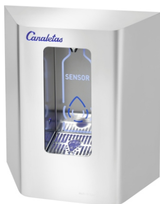
Model: BS-2 OP

Optional filters: Carbon block, Sediment, UV filters, Ultrafiltration or RO.