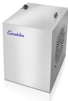
Cooling unit: GF-86H

*R-290 is a natural refrigerant with no ozone impact. It offers high efficiency and reduces energy consumption.