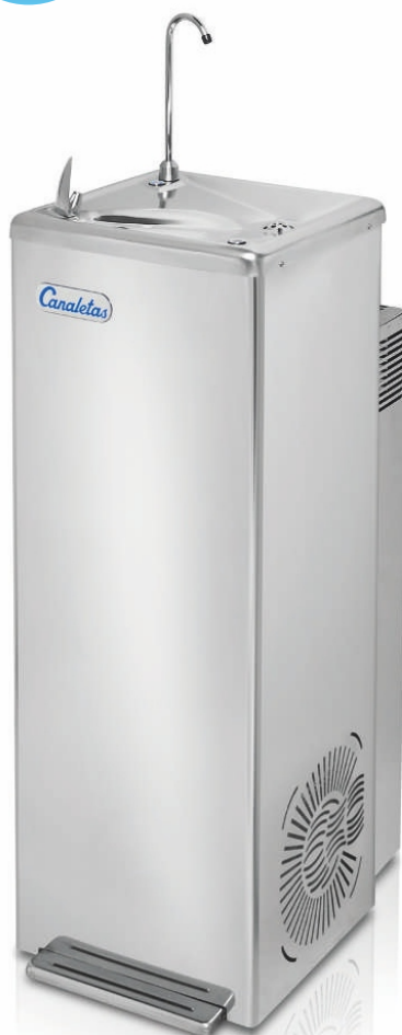
Model: M-66ALV RO